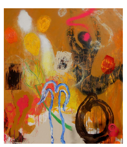
Dewey Crumpler, Water Mix, 1998, signed verso, acrylic on canvas, 82 \times 74 inches