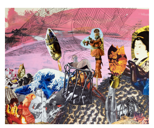
Dewey Crumpler, Untitled , 2018. Courtesy of the Artist and Jenkins Johnson Gallery

Mostly devoid of figurative representation, save a small section of collages including the likenesses of Black icons such as James Baldwin, Jimi Hendrix, and Biggie Smalls, the works in this exhibition at Richmond Art Center elliptically gesture to inchoate and sometimes incomprehensible forms of Black life and knowledge through the metaphorical and material site of the