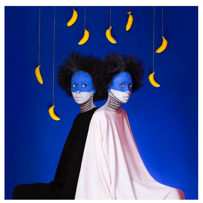
Aïda Muluneh, Both Sides, 2017, photograph printed on Hahnemuehle photo rag bright white, 60'' \times 60''