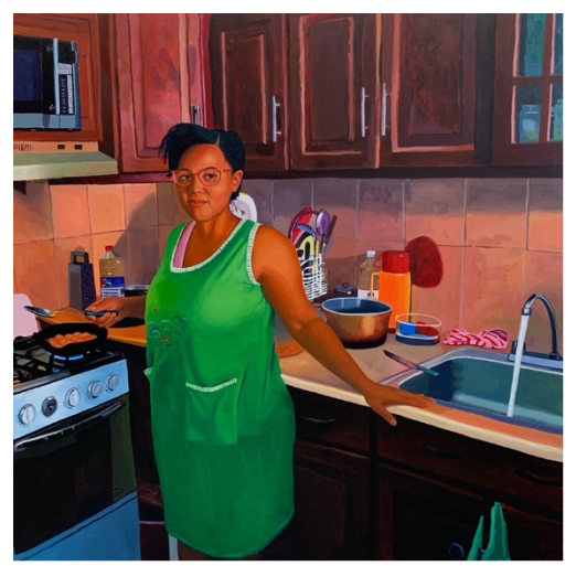
2023, oil and acrylis on canvas, 60 \times 60 inch

directly inspired by 19th Century Orientalist painting. The subjects of her photographs are often draped in highly patterned fabrics that match the Moroccan architectural ornamentation.