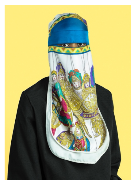
Wesaam Al-Badry, Gucci #VII, 2018 archival pigment print, 36 \times 26 in

The gaze throughout art history has been used as a tool to aid the viewer in understanding an artwork's narrative. Differentiating it from a stare, the gaze is a used to evoke active communication