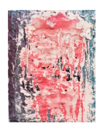
Above: Leonardo Benzant, The Morning & Night Visual Diary, 2016, ink, water color, and gouache on paper, 14 \times 17 "; Leonardo Benzant, The Morning & Night Visual Diary, 2016, ink, water color, and gouache on paper, 14 \times 17 "; Vaughn Spann, Untitled (Mood), 2017, yarn, clay, acrylic paint, spray paint on stretcher bars, 12 \times 9 "