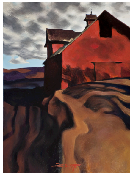
Autumn Storm , 2011, oil on canvas, 48 x 36 inches