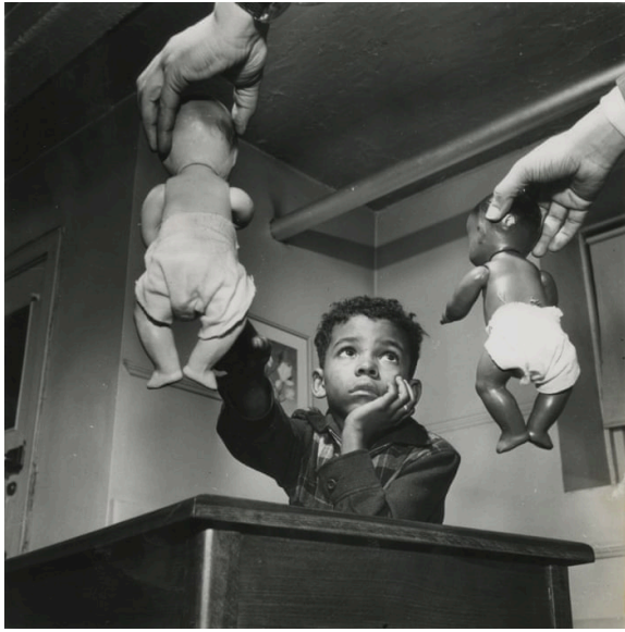
Gordon Parks, Untitled, Harlem, New York, 1947, 1947 , silver gelatin print.