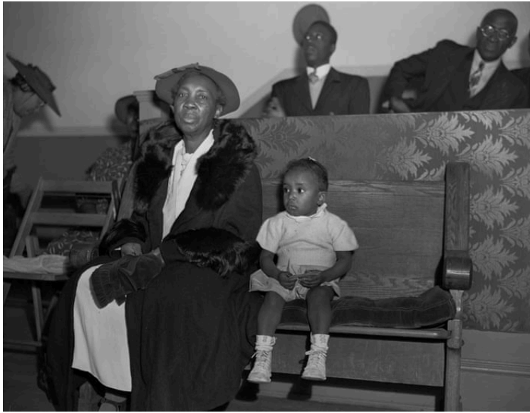
Gordon Parks, Deacon's corner in the Church of God the Christ , November 1942.