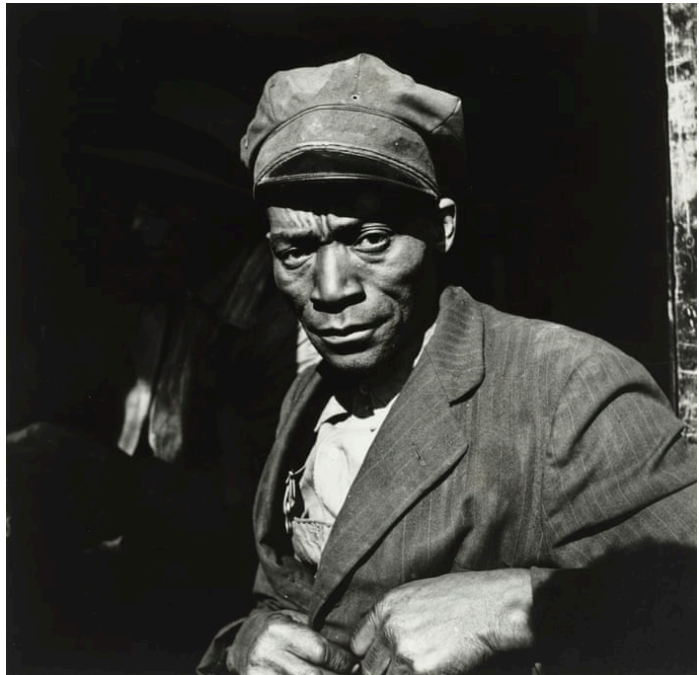
A coal 'sketcher' is a helper on a coal truck. The number of trips he makes a day determines the extent of his salary. Harlem River, New York City. November 1946, 1946.