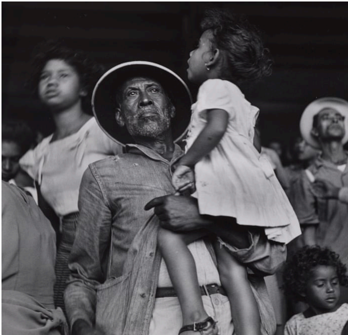
Gordon Parks, Untitled, Puerto Rico (Inauguration of Luis Munoz-Marin) January 1949, 1949, silver gelatin print.