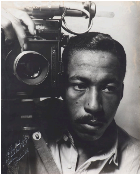
Gordon Parks, Self-Portrait , 1941, silver gelatin print.

In the 1940s, Parks went from being a self-taught photographer to an in-demand figure in the industry, shooting for Ebony , Vogue , Fortune and Life . For the first time, his formative decade is being celebrated in an exhibition at the National Gallery of Art in Washington.