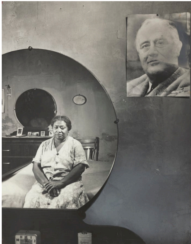
Gordon Parks, A Woman in her Bedroom November 1942, 1942, silver gelatin print.