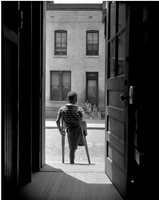
Gordon Parks, Untitled , 1942, silver gelatin print.