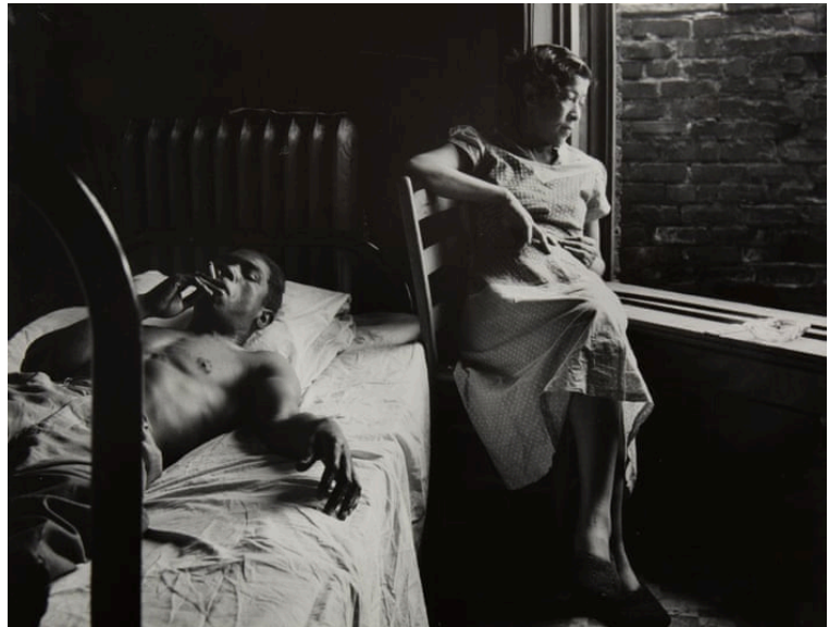
Gordon Parks, Tenement Dwellers, Chicago , 1950, silver gelatin print.