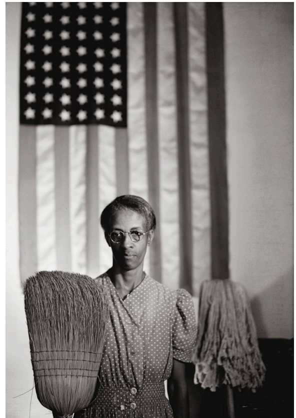
Gordon Parks, American Gothic , Washington DC, 1942, silver gelatin print.