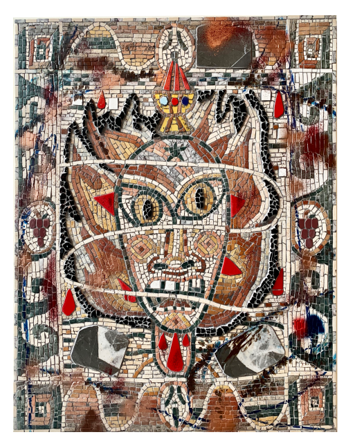
Cameron Welch, Hot Head , 2021, marble, glass, ceramic, oil, acrylic and spray enamel on panel in artist frame, 47.5 \times 37.5 in