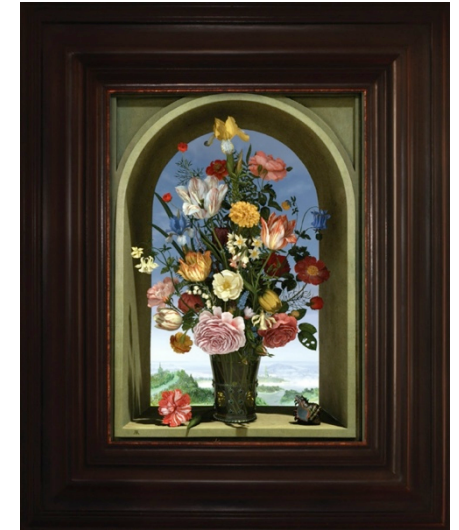
Transforming Nude Painting, 2013, 2.5 hour looped film, computer, frame, 32 \times 47 \times 4 inches, edition of 12