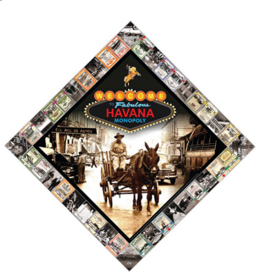
2013, Archival pigment prints on aluminum, print, 191/2 x 27 inches 501/2 x 501/2 inches