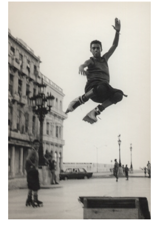
Lissette Solórzano, Havana Coastline, 2005, Archival pigment print, 23½ x 31½ inches