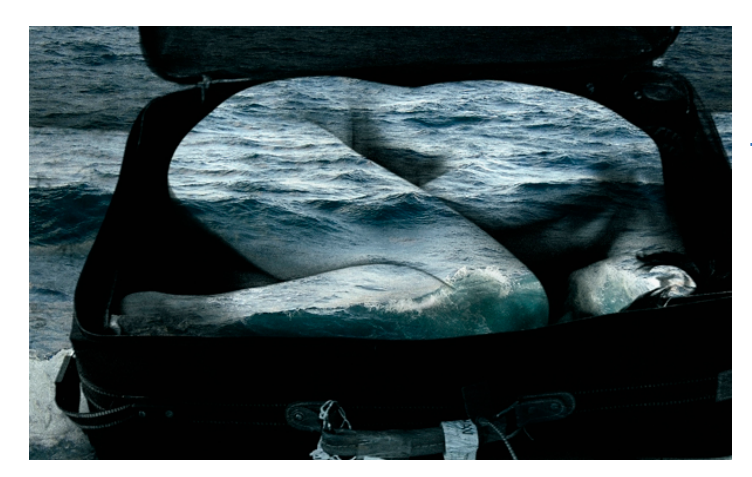
Liudmila & Nelson, Untitled, from the series El Viaje, 2004, Archival pigment print, 26.75 \times 42 inches