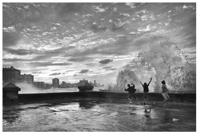
Eduardo García The Wave, from the series The Wall of Wonders, 2011, Archival pigment print, 12.5 × 18.75 inches

The exhibition also features works in vibrant and stunning colors such as the photographs by Pavel Acosta and Alejandro González . It is illegal in Cuba to import and