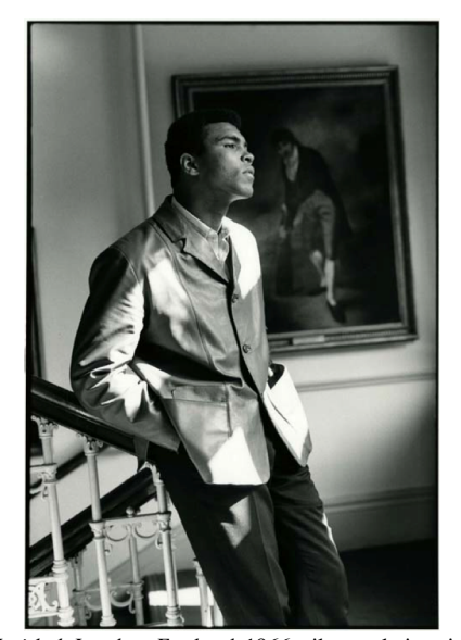
Untitled, London, England, 1966, silver gelatin print.

The Black Panther Party, founded in 1966 in Oakland, California (2016 marks the fiftieth anniversary of the establishment of The Black Panther Party), was led by Huey Newton, Bobby Seale, and Eldridge Cleaver. Practicing militant self-defense of black communities, the group monitored the police and challenged their prevalent brutality. The group was recognized for their combative revolutionary methods and their battle cry "Black Power." Gordon Parks was given the assignment to report on the Black Panthers in 1970, shortly