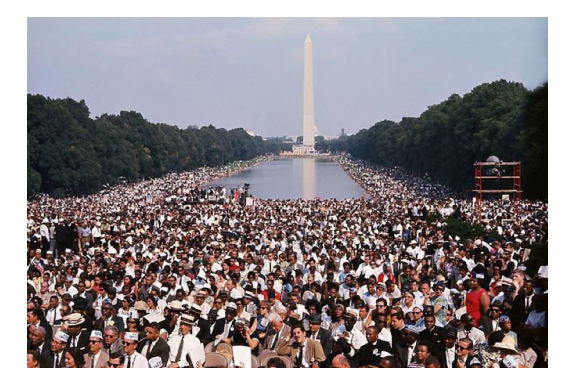
Untitled, Washington, D.C., 1963, pigment print.

Pressing on the upward way • New heights I am gaining every day; Still praying as I onward bound • Plant my feet on higher ground.