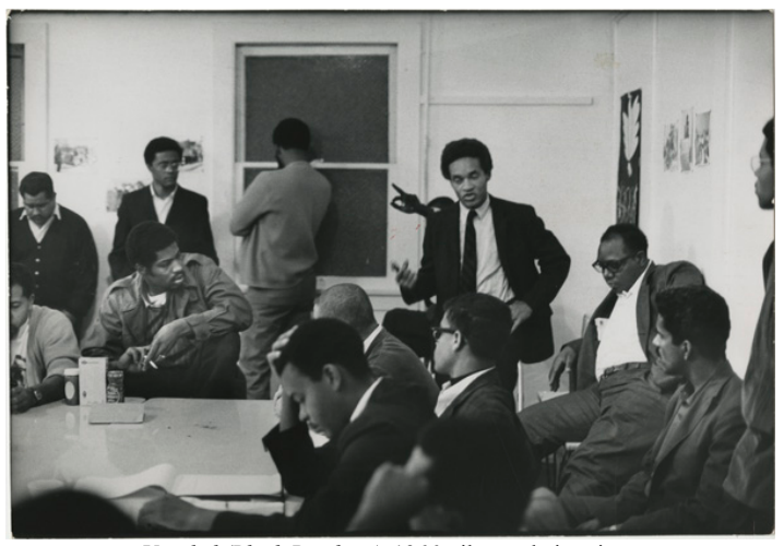
Untitled (Black Panthers), 1966, silver gelatin print.

Jenkins Johnson Gallery, San Francisco is pleased to present Gordon Parks: Higher Ground , a solo exhibition of over sixty works by one of the most important photographers of the 20<sup>th</sup> century. The gallery's second solo exhibition for Parks, on view from February 4 through April 2, 2016, will commemorate his photo essays on the Civil Rights Movement.