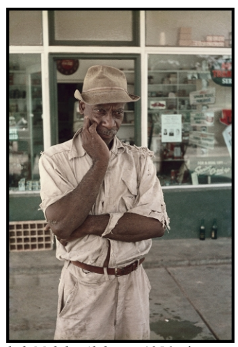
Untitled, Mobile, Alabama, 1956, pigment print.