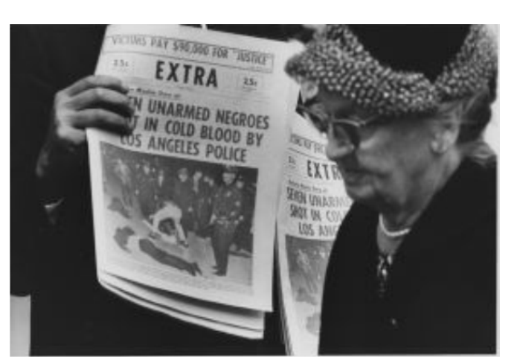
Untitled, Harlem, New York, 1963, silver gelatin print.