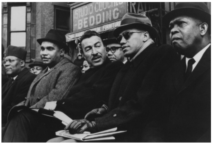
Untitled, Harlem, New York, 1963, silver gelatin print.