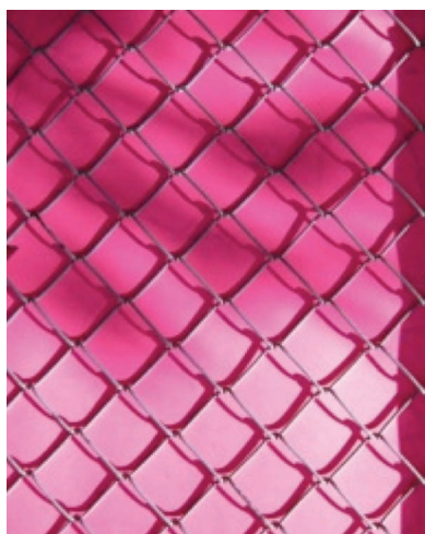
Untitled (Fence on pink), 2016, c-print photograph, 10 x 8 "