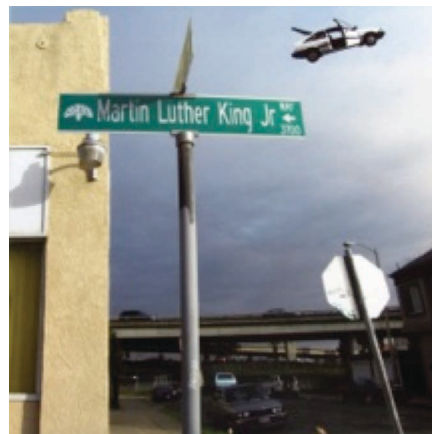
Untitled (Martin Luther King Blvd. and Honda), 2014 c-print, 12 x 12 "