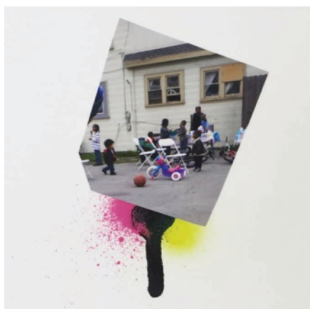
Untitled (Babies), 2016, collage and spray paint, 18 x 24"

Jenkins Johnson Gallery, San Francisco, is proud to present its first solo show by interdisciplinary artist Sadie Barnette (b. 1984, Oakland, CA). FROM HERE will feature drawings, collage, photography, and found objects, creating a dynamic installation exploring the abstraction of urban space and the transcendence of the mundane to the imaginative. There will be a reception for the artist on Saturday, September 17, from 2:00 to 4:00 pm, in conjunction with the Union Square Art Walk. The exhibit runs from September 15 through October 29, 2016. Barnette will be featured in the exhibition All Power to the People: Black Panthers at 50 at the Oakland Museum, running concurrently from October 8, 2016 to February 12, 2017. Sadie Barnette will also be featured in a solo show at the Untitled art fair in Miami Beach, November 30 to December 4, 2016.