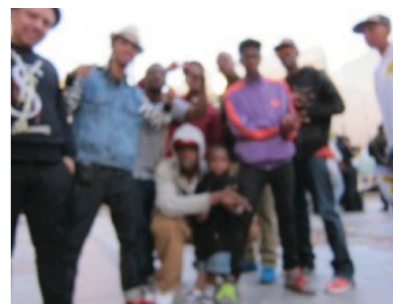
Untitled (Crew), 2011, c-print, 30 x 36 "

Reception for the Artist: Saturday, September 17, 2:00 - 4:00 pm San Francisco