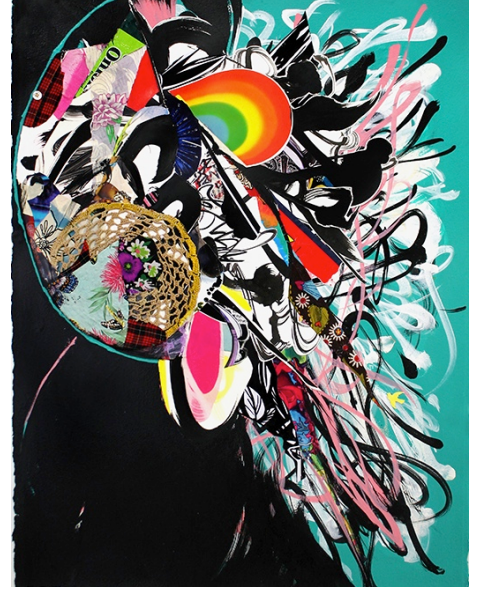
Shinique Smith, Beautiful Dreamer, 2015, acrylic, ink, fabric and collaged painting on paper, 30 \times 33 inches