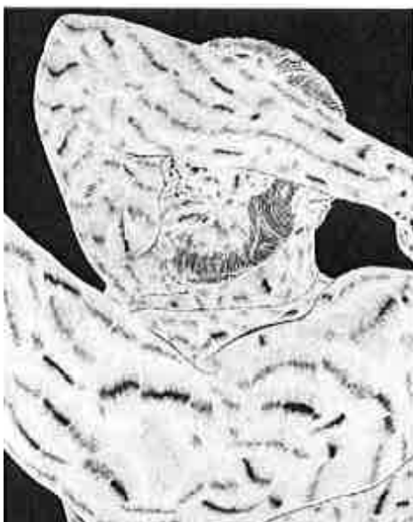
Toyin Ojih Odutola, Farther Still, 2016, charcoal on board, 40 × 30 inches. ©Toyin Ojih Odutola. Courtesy of the artist and Jack Shainman Gallery, New York.