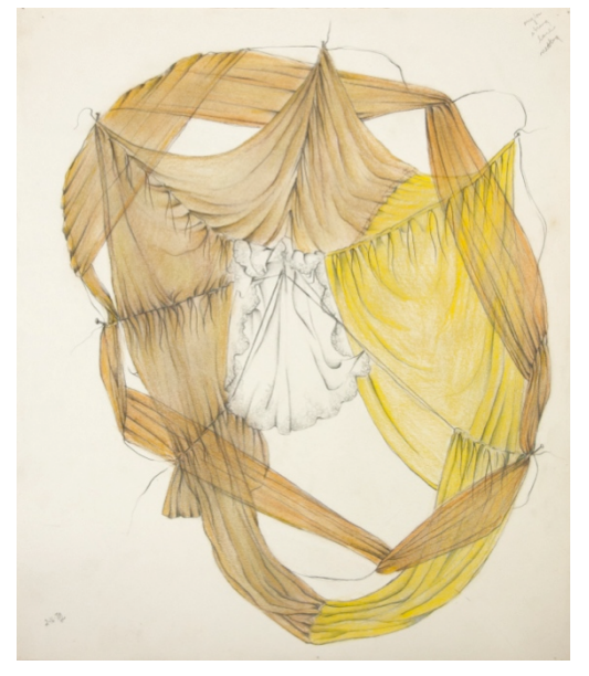
Rosemary Mayer, Untitled (Demedici) (RMSDWG03), 1972, colored pencil and graphite on paper, 17 × 14 inches.

For more information on this exhibition please contact the gallery at 415.677.0770 or sf@jenkinsjohnsongallery.com