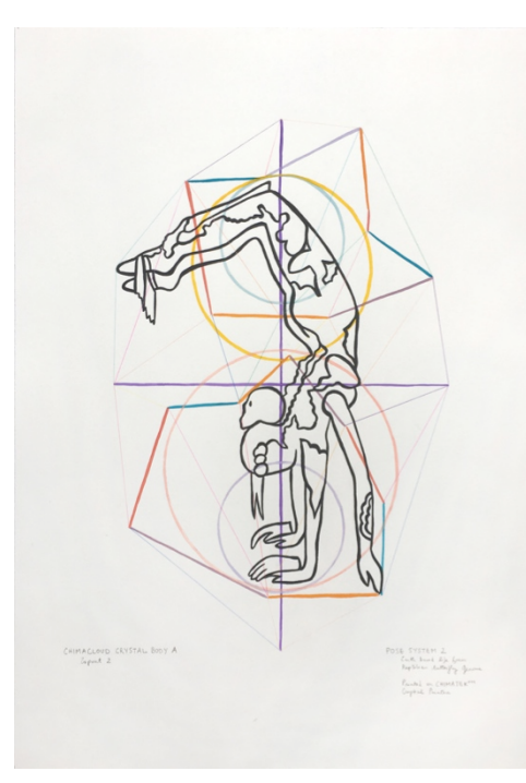
Saya Woolfalk, ChimaClouds Crystal Body A: Export 2, 2017, gouache, watercolor, colored pencil, and graphite on paper, 23 ^3\!\!\!/ \times 17 ^\prime\!\!/ inches