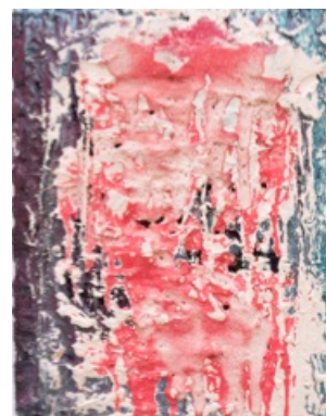
Above: Leonardo Benzant, The Morning & Night Visual Diary , 2016, ink, water color, and gouache on paper, 14 x 17"; Leonardo Benzant, The Morning & Night Visual Diary , 2016, ink, water color, and gouache on paper, 14 x 17"; Vaughn Spann, Untitled (Mood) , 2017, yarn, clay, acrylic paint, spray paint on stretcher bars, 12 x 9"