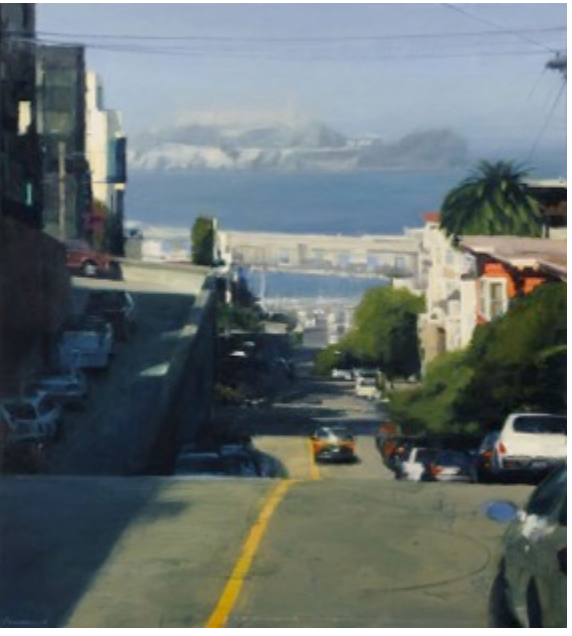
Ben Aronson, Receding Fog, San Francisco Bay, 2018, oil on panel, 35 \times 32^{\prime\prime}

With loose painterly strokes and a deft rendering of atmospheric light, fleeting and familiar moments of cars breezing by and the afternoon sun casting long shadows onto the road materialize in visual poetic verse. Building from studies created en plein air, Aronson's specificity and attention to light and shadow transport his viewer to a precise location and an exact moment in time, from early morning in the Hollywood Hills to late afternoon in SoHo. Foundational to Aronson's work is his innate ability to capture light, and the ways in which light varies between and within the cities he visits. While a robust, vibrantly deep orange dominates Morning, Fifth Avenue, a somber, languishing blue washes over Manhattan in Soho. Similarly, San Francisco's infamous fog materializes with Aronson's use of cool blue interspersed with a gauzy white; elsewhere, the warm crisp reflective yellow rays characteristic of the sun drenched pavement of streets of Los Angeles pulse. Aronson's diversified use of light and color demonstrates his range in depicting cities and neighborhoods with specific atmospheric moods.